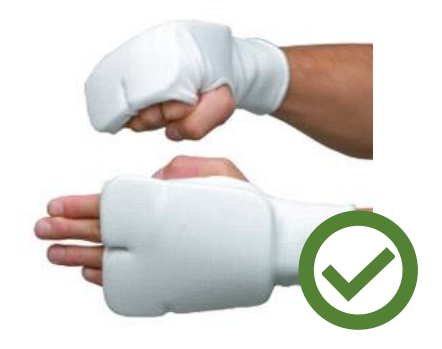
A soft material covered by fabric is good to be used.