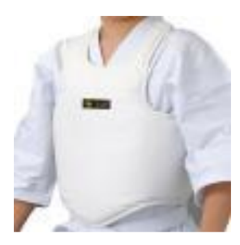
Lightweight Body Pad (BP40)