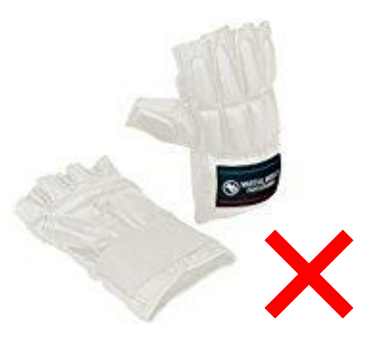
Leather gloves other than ISAMI are <u>not</u> approved.