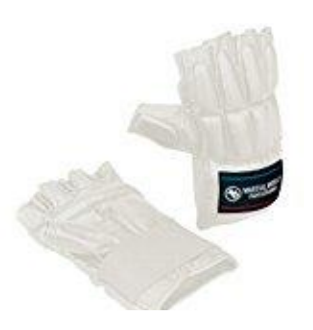
Leather Finger Gloves (PG38)