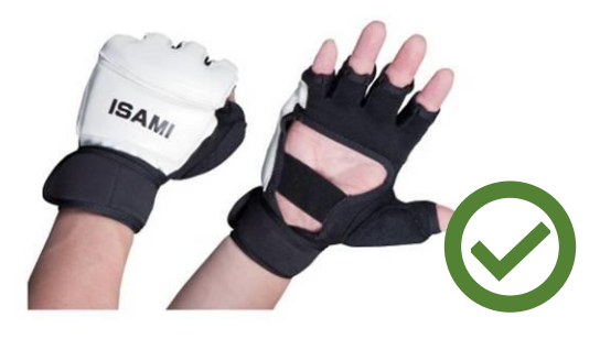
For other materials, the gloves manufactured by ISAMI (TN-1) is only approved to be used.