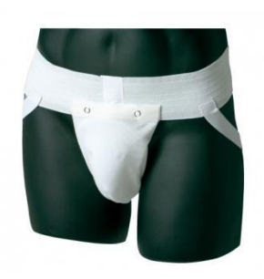
Groin Cup with fabric straps (GG51)