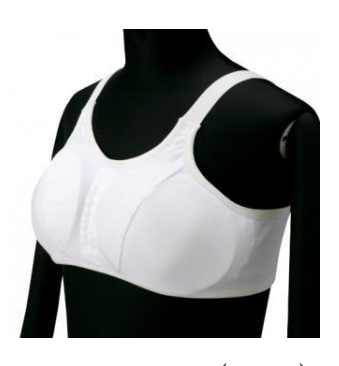
Breast Guard (CG32)