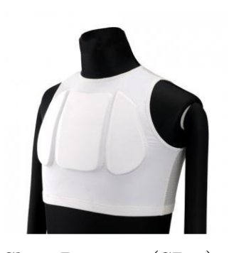
Chest Protector (CP11)