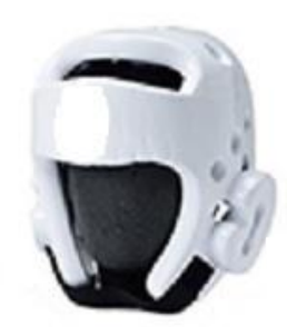
Polyurethane Head Gear (HG39)