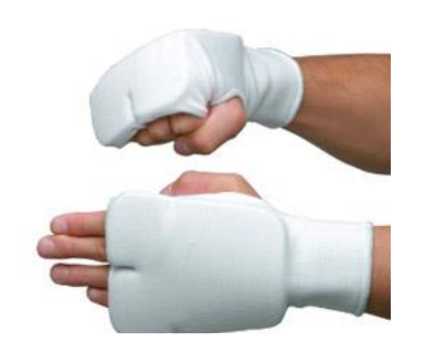
Finger Gloves covered by fabric (NG24)