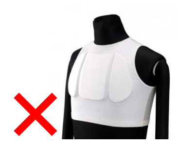
Chest Protector is not allowed.

The inner padding must be made of soft materials like sponge. Hard materials such as plastic are not allowed.