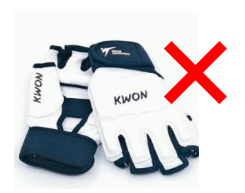
This type of gloves made by KWON is not allowed due to its thin padding.